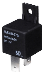
NVF4-7 26.5×26.5×25.2 NVF4-8 26.5×26.5×25.2(+16)